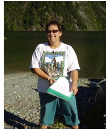
A familiar sight during the survey with an interviewer at the boat ramp in Milford Sound.