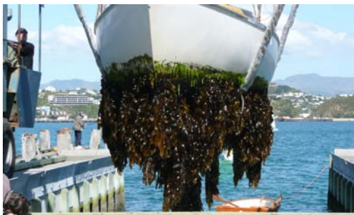
The new owner of this yacht in Wellington got a big surprise when he pulled it out of the water recently! What looks clean from above could be dirty below.

An integral part of the Guardians' work is protecting the unique Fiordland marine environment from potentially harmful invasive marine pest species together with MAF Biosecurity New Zealand (MAFBNZ), the government agency responsible for marine biosecurity.