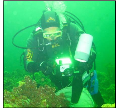
Diver at work during the research

The first project was aimed at carrying out a comprehensive survey of the 'china shop' areas of the fiords, which are areas notable for containing particularly high diversity or high abundance of uncommon or fragile species. The data collected is still being worked through, but observations on the trip were that each china shop had distinctive characteristics, some with extremely high diversity of species, and that a number of new and undescribed species have been found.