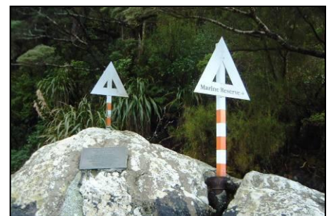
Current DOC Marine Reserve Markers