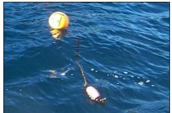
Buoys indicating commercial lobster pot