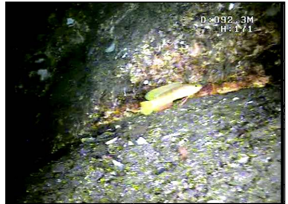
The Traffic Light Fish – newly discovered

Ken Grange, NIWA, and Fiordland Marine Guardian