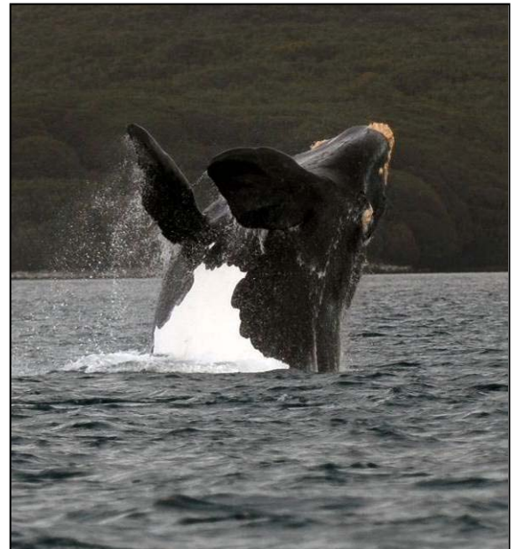
Southern Right Whale

The sightings also help support the Otago University research programme which is looking into photo identification and habitat use of Southern Right Whales around New Zealand waters.