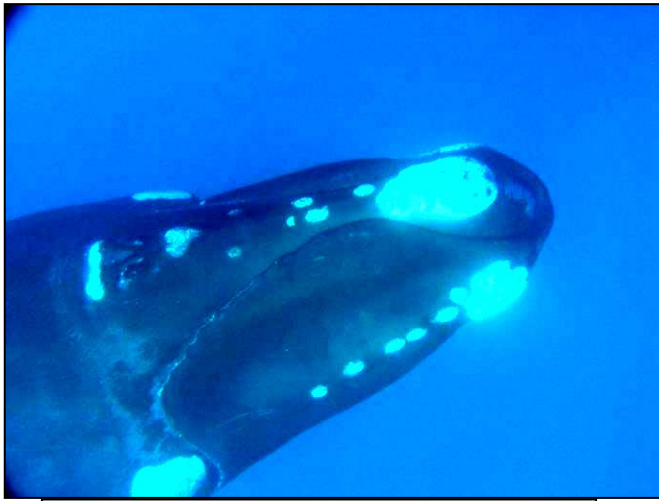
Southern Right Whale – photo courtesy of DOC

From data analysed so far by scientists at the University of Auckland, there have been three matches between the mainland and sub Antarctic whales. The continuation of this research will enable the Department to take measures to ensure the whales have the right level of protection.