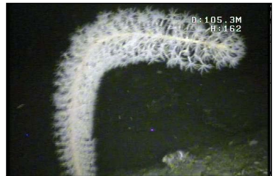
Feather Seapen – newly discovered.

As part of the biological monitoring programme, DOC contracted NIWA in 2009 to explore the deeper reefs of the fiords, below diving depths. We used two methods to sample the animals of the deep reefs, a small Remote-operated Vehicle (ROV) equipped with video camera and laser beams to measure the sizes of species, and a