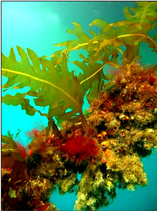
One of the mooring lines in Sunday Cove illustrates the invasive nature of Undaria.

Undaria is a fast-growing seaweed that can spread rapidly, displacing native species, and having major impacts on marine ecosystems. It could have devastating impacts on the precious Fiordland Marine Area.