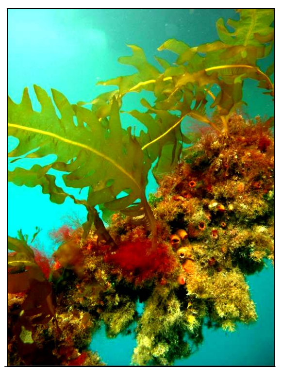
One of the mooring lines in Sunday Cove illustrates the invasive nature of Undaria.

Undaria is a fast-growing seaweed that can spread rapidly, displacing native species, and having major impacts on marine ecosystems. It could have devastating impacts on the precious Fiordland Marine Area.