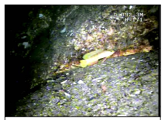
The Traffic Light Fish – newly discovered

It is clear that more discoveries will be found as we extend our sampling. It's quite possible we have still only begun to scratch the surface of the unique marine biodiversity of the NZ fiords. Ken Grange, NIWA, and Fiordland Marine Guardian