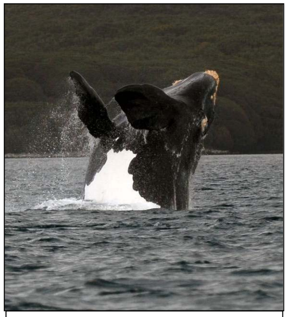
Southern Right Whale

The sightings also help support the Otago University research programme which is looking into photo identification and habitat use of Southern Right Whales around New Zealand waters.