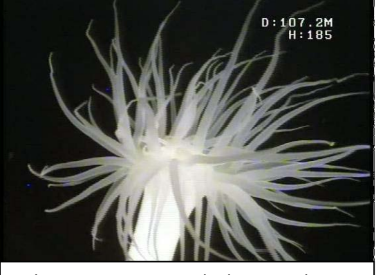
White Anemone – newly discovered

Below that depth the reefs and rock walls supported a variety of tube worms, sponges and stony corals, most of which have never been seen before. In fact, of 145 different types of animals we recorded on video, over 56% could not be identified even by expert biologists.